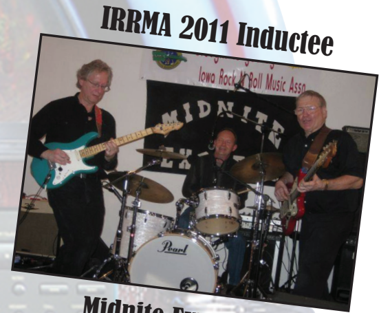
IRRMA 2011 Inductee