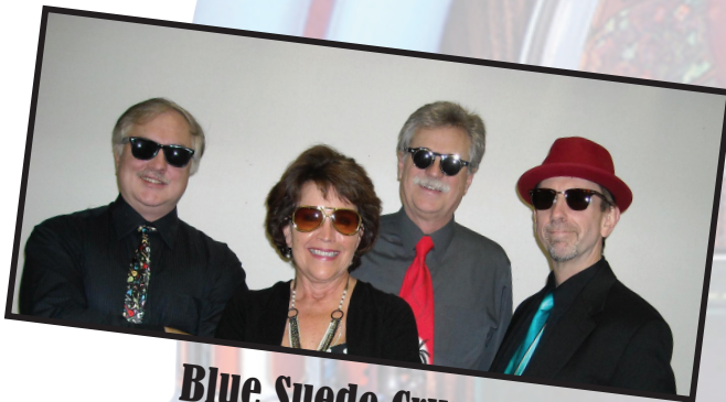
Blue Suede Cruze

Beautiful Historic Electric Park Ballroom in Waterloo, Iowa